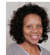
DeeDee Fields Landeedingdam Dosland Daycare