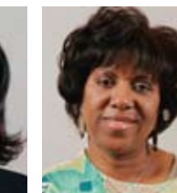
Eunice Sanders Durham Public Schools